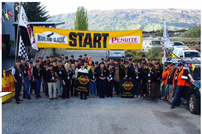
One of the colourful starts from the 2010 Mainland Classic. Here in Wanaka.